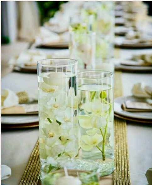
CANDLELIGHTSOIREE ~$27.50 EACH

Minimum 6 centerpieces per order unless stated otherwise