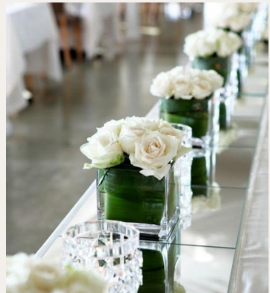
ROSE CUBE ~$44.95 EACH