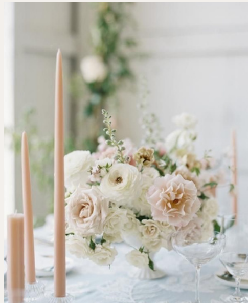
CLEMENTINE GARDEN VASE ~$95.50 EACH