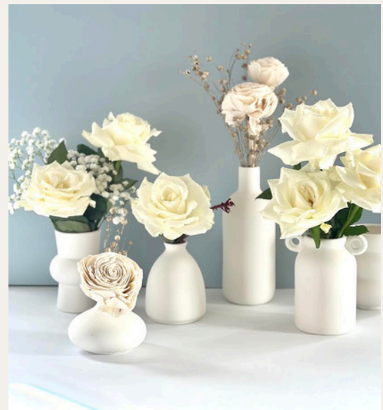
MODERN SOHO MIX ~$19.50 EACH