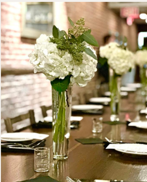
ALEXANDRA VASE ~$39.50 EACH