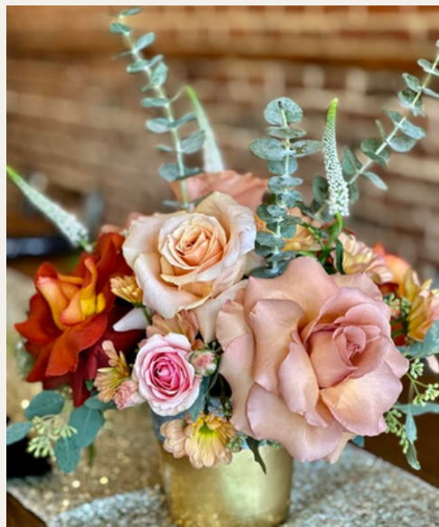
FOUR SEASONS VASE ~$49.95 (SEASONAL)